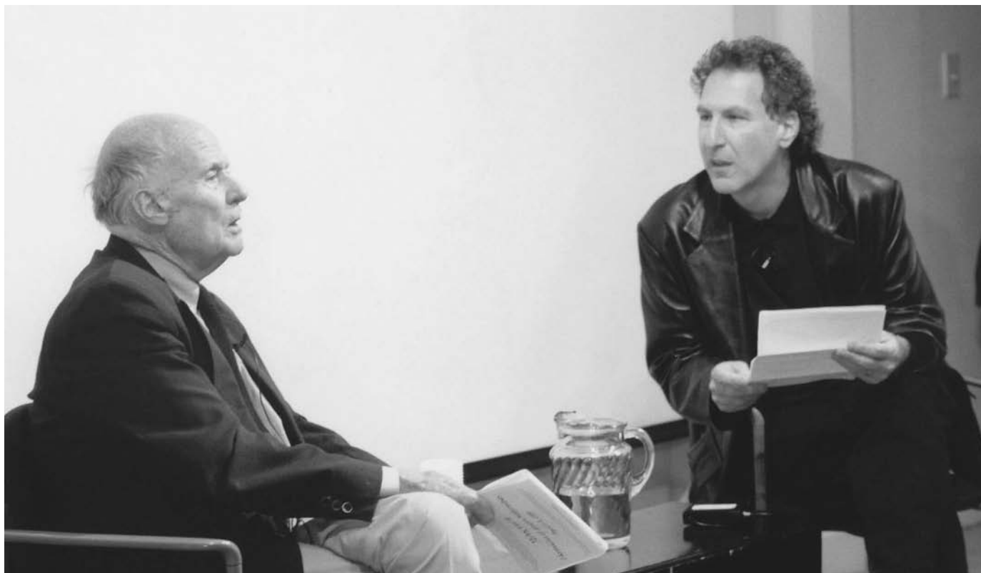
FIGURE 11. Jean Rouch and Steve Feld at New York University in April 2000.

the New York University's Rouch 2000—at the Chronicles of African Modernities Retrospective (see Figure 11). It was a lovely time, full of good feeling, and just after he left New York, I sent him the poem below as a small souvenir of our reencounter.