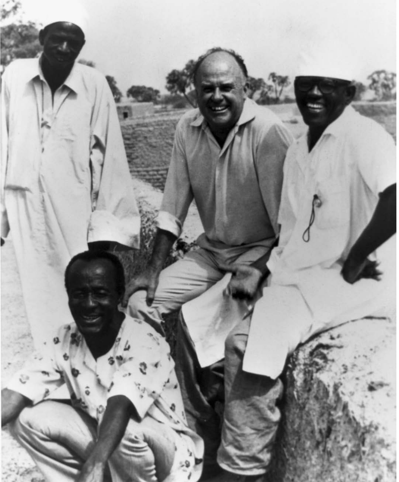
FIGURE 10. Jean Rouch and friends.