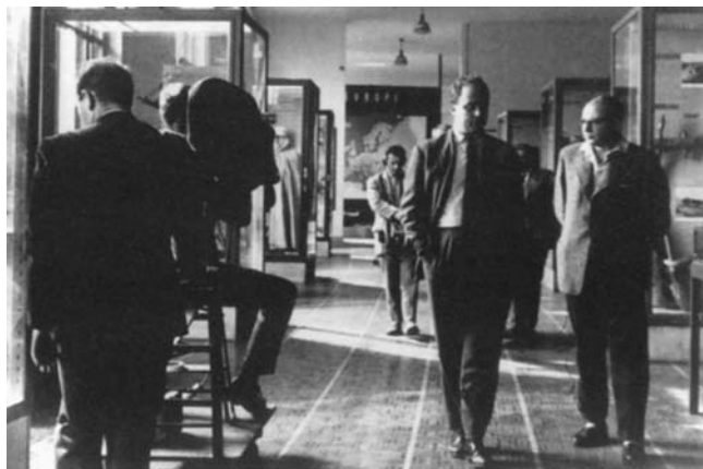
FIGURE 3. Jean Rouch and Edgar Morin in the Musée de l'Homme (Chronicle of a Summer 1960).