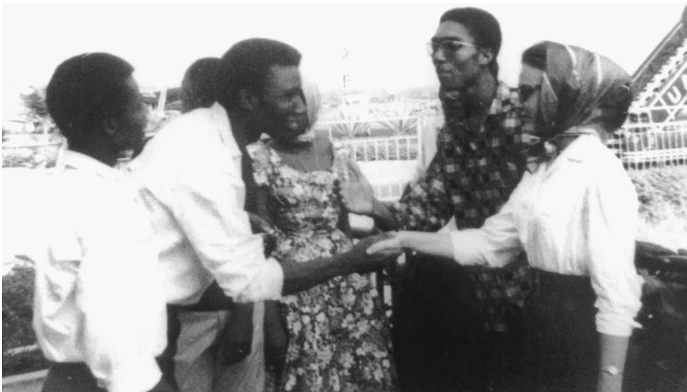
FIGURE 7. La pyramide humaine 1959.

only be interested in their own country. Tensions mount until the discussion seems on the brink of real rancor. Suddenly, the camera pans left, revealing that it is actually filming a projection of the debate on a movie screen, and that the students, along with Rouch, are laughing together in the screening room at images of themselves filmed much earlier. This piece of cinematic legerdemain both emblemizes Pyramide's equivocation of generic codes (fiction-documentary) and crystallizes its political message. The incongruity of the bemused group watching their own heated argument reveals the mechanism of the film's production and indexes the small, but seemingly real, public sphere that the filming helped create.