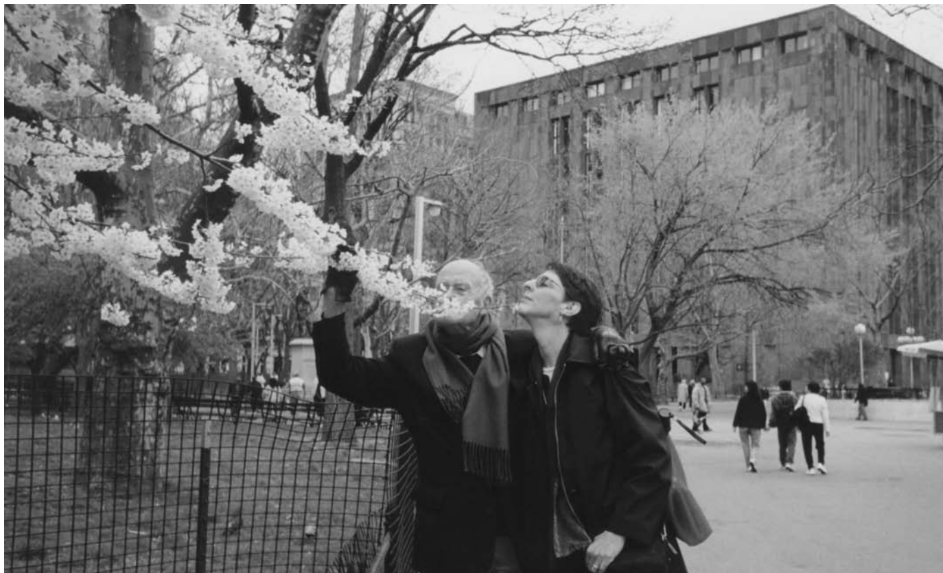
FIGURE 2. Jean Rouch in an antic moment en route to his retrospective, New York, April 2000.

works Moi, un Noir (1959) and La pyramide humaine (1961). Both films are set in Abidjan. The first film is set among migrants from Niger working in the slums of Treichville. The second is a drama created with black and white students in a fictional integrated high school class (a film credited as the precursor to his cinema vérité classic, Chronique d'un Été [1961]).