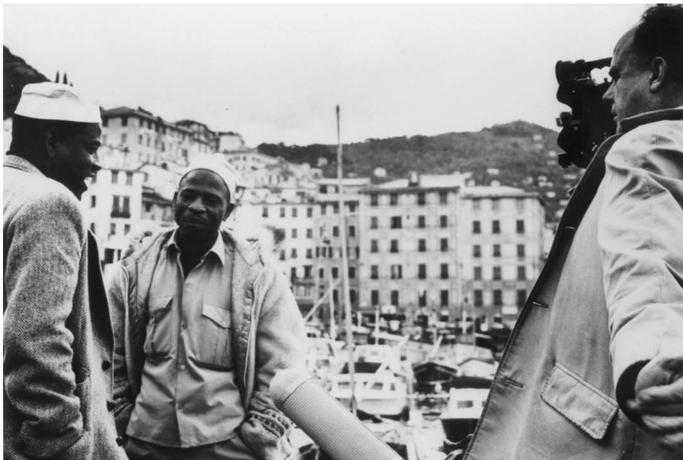
FIGURE 8. Petit à Petit 1968–69.

Rouch confirmed, prolonged, resisted, and distorted André Bazin's realist paradigm.